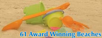
61 Award Winning Beaches